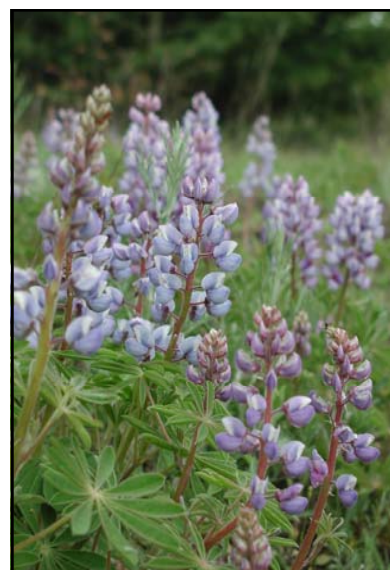
Wild lupine fills the fields at the Maas Family Nature Preserve in the spring.

To protect the integrity of the nature preserve, the Land Conservancy relies on the support of a dedicated group of stewardship volunteers. Volunteers help with preserve clean-up, removal of invasive plants, and serve as the eyes and ears for the preserve. If you are interested in lending a helping hand, please contact Melanie Good at 616-451-9476.