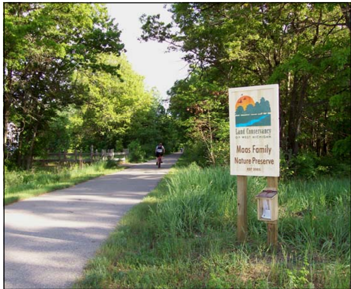
The Maas Family Nature Preserve is located along the White Pine Trail in Algoma Township.