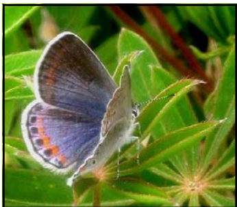
The federally endangered Karner blue butterfly.

This undeveloped property lies on the west side of the White Pine Trail, just north of the Rogue River and the city of Rockford in Algoma Township. Although there is a small forested area and a shrubby wetland area in the southeast corner, most of the property is “savanna” habitat – an open, prairie-like field with scattered trees.